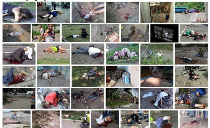
Figure 8: Kiev Euromaidan junta war crimes in Donbass region in 2014.

Here, we came probably to the crux of the matter of current Ukrainian crisis and most probably “Ukrainian Question” in general. It is well known that Russia’s president V. Putin is extremely frustrated with the NATO’s 1999 Kosovo humanitarian intervention as it is seen by Moscow as a great humiliation of Russia and the Russian national proudness and the regional state’s interest. It is also well known that the Euromaidan regime in Kiev committed and still is committing the terrible war crimes in Donbass region which can be classified as the ethnic cleansing and even a form of the genocide as thousands of Donbass region inhabitants are brutally killed (among them around 200 kids) and approximately one million of them became the refugees in Russia (Fig 8).