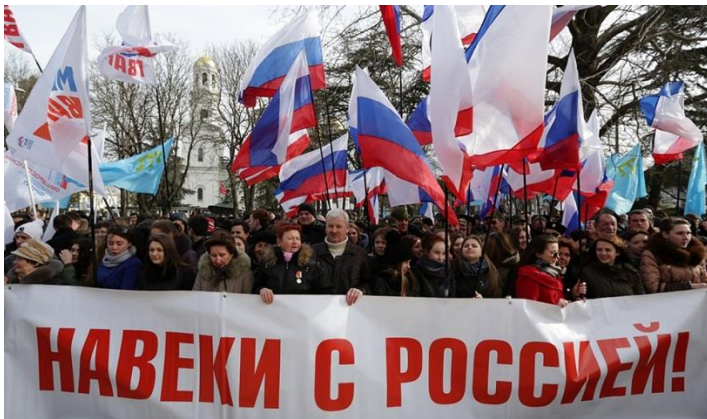
Figure 5. Popular support for Crimea’s re-annexation by Russia by the majority of peninsula’s residents – “Forever with Russia”

consequence, it had direct “boomerang effect” with regard to the case of Crimean secession from Ukraine and following annexation by Russia. We have to remember that Crimea broke away relations with Ukraine calling for the same formal reasons used by the Albanians in the case of the 2008 “Kosovo precedent” followed by other legal arguments. Nevertheless, the western countries recognized Kosovo independence from Serbia but not Crimean, Donetsk and Luhansk separation from Ukraine regardless the fact that all of these cases are formally and officially based on the same legal and moral arguments. Moreover, differently to “Kosovo precedent”, separation cases in Ukraine are based on the results of the Plebiscites (Fig 5).