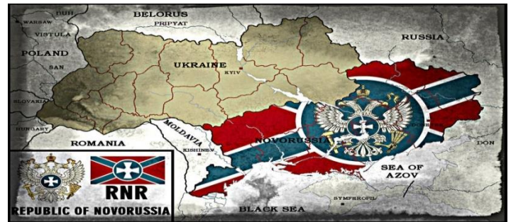
Figure 4. A projected territory of the Republic of NovoRussia.

“Kosovo precedent” and the Ukrainian suicide: The revolt and colored revolution by the Russian-speaking population in