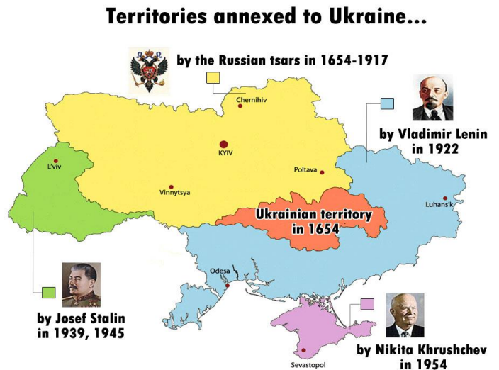
Figure 1. Historical process of making a Greater Ukraine.

Historical background of the Ukrainian statehood: The German occupation forces were those who have been the first to create and recognise a short-lived state’s independence of Ukraine in January 1918 during the time of their own inspired and supported anti-Russian Bolshevik Revolution of 1917–1921. As reoccupied by the Bolshevik Red Army, the eastern and southern parts of the present-day territory of (a Greater) Ukraine joined in 1922 the USSR as a separate Soviet Socialist Republic (Fig 1).