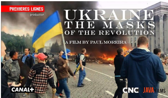
Figure 3. A poster for the movie.

supported ultra-nationalistic and even a neo-Nazi coloured political upheaval of the “Euromaidan” protesters in Kiev (Cartalucci, 2014) and some other bigger western Ukrainian cities (like in Lvov) directly provoked a new popular coloured revolution in the Russian speaking provinces of the East Ukraine and Crimea with a final consequence of a territorial secession of self-proclaimed Luhansk, Kharkov, and Donetsk People’s Republics and Crimea (according to Kosovo pattern from 2008).