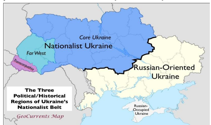
Figure 7: The regions of Ukraine’s nationalist affiliation.

Humanitarian intervention and final solution: Current Ukrainian crisis in this case can be solved according to the 1667 Andrussovo Treaty signed on February 9th between Poland-Lithuania and Russia. According to the treaty a present-day territory of Ukraine was simply divided between two states: the Polish-Lithuanian Commonwealth (the