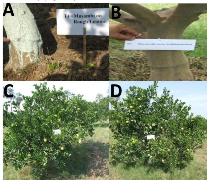
Figure 1: Scion and stock circumference grafted on rough lemon) (A), Volkameriana (B), Musambigrafted on Volkameriana (C) and rough lemon (D).

The study was conducted at the Citrus Research Institute, Sargodha, Punjab, Pakistan, during 2008-2017. For this purpose, rough lemon and Volkameriana root stocks were taken into account. The rootstocks were propagated from mother plants located and, after one year, the plants were grafted using inverted T-bud with sweet orange ( Citrus sinensis [L.] Osbeck) bud. Rough lemon is the traditional rootstock being used for various scion varieties at Punjab successfully (Figure 1).